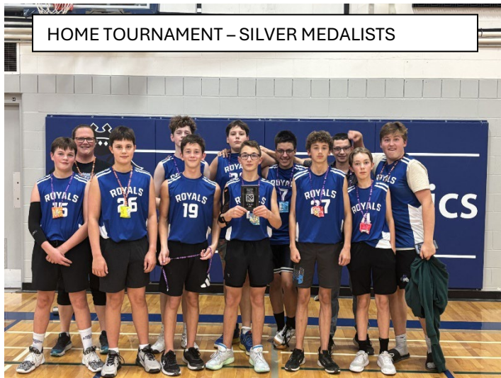
HOME TOURNAMENT - SILVER MEDALISTS