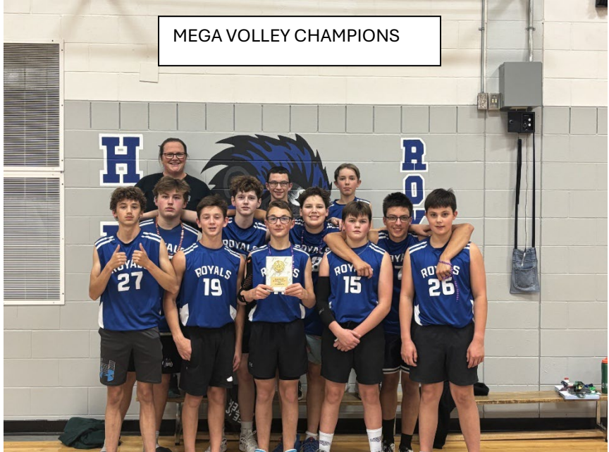
MEGA VOLLEY CHAMPIONS