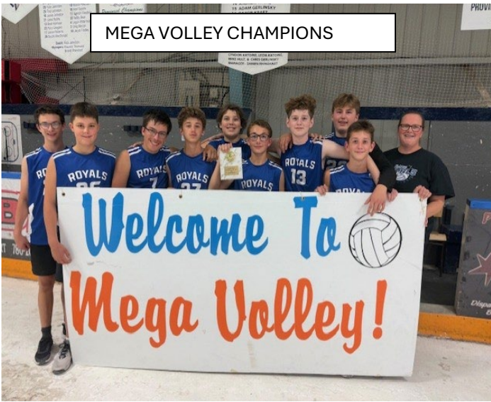
MEGA VOLLEY CHAMPIONS