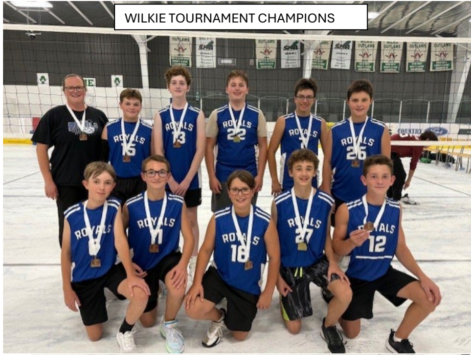
WILKIE TOURNAMENT CHAMPIONS