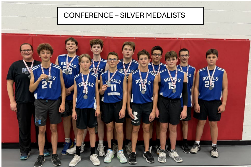
CONFERENCE - SILVER MEDALISTS